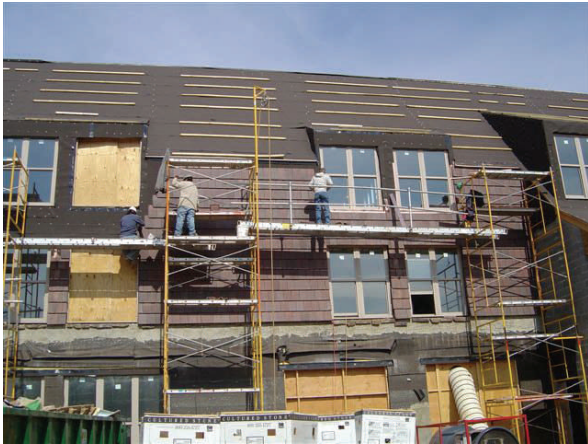
Under construction. The interlocking tiles are installed working from the left to the right.