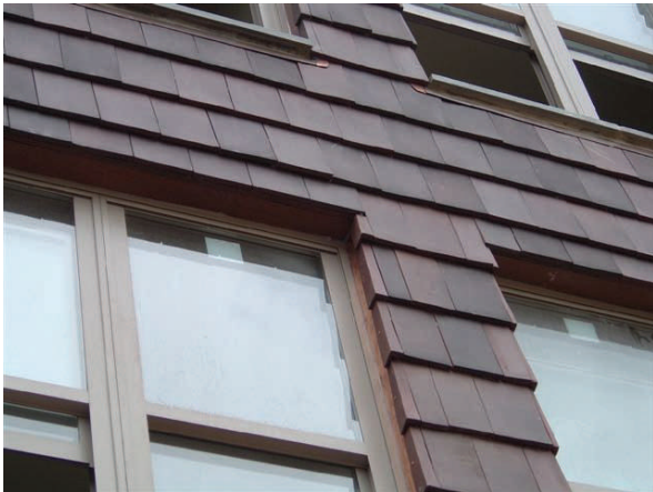
The clean look at the windows is finished with copper headers and trim at the jambs.