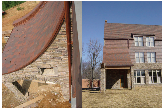
Graceful lines at this covered porch area are created by a curved roof accommodated by the Classic Interlocking tile.