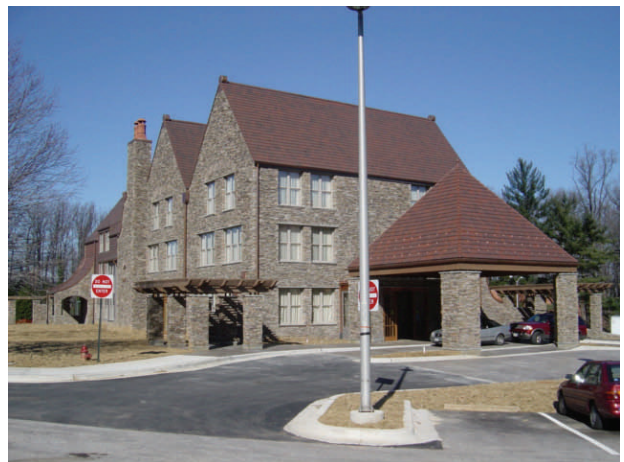
View from the entry and covered Porte cochere. If you look very closely you will see the custom Ludowici Terminal with ball on top as the finishing touch.